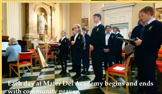
Each day at Mater Dei Academy begins and ends with community prayer.